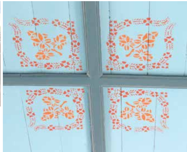
Clockwise from top left: 1. Interior, Christ Lutheran Church, Noack, Texas. 2. Traditional female costume, Wendish Heritage Museum, Serbin, Texas. 3. Decorative ceiling motifs, St Paul Lutheran Church, Serbin, Texas.

They arrived at Houston aboard the Ben Nevis after an arduous journey where the travellers were beset by cholera, yellow fever and other ailments. By the time they arrived at the location of their eventual settlement early in 1855, eighty-three men, women and children had perished.